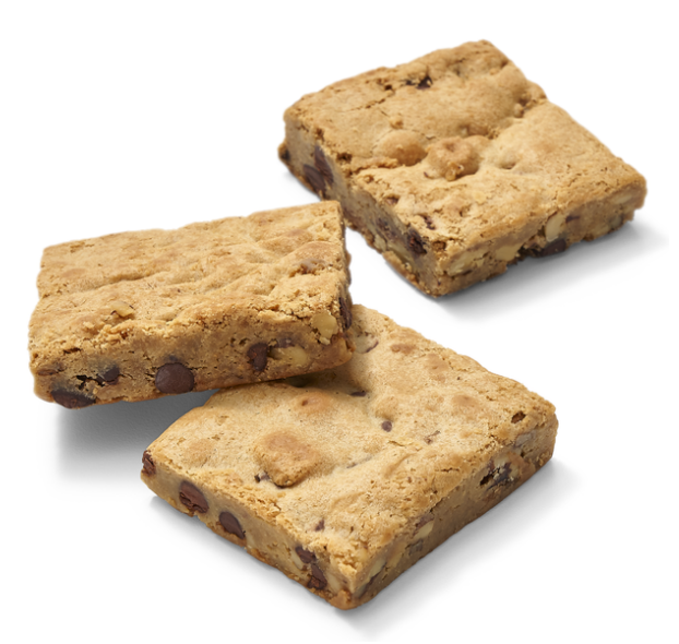
Consumer Unit Net: 3.2 oz / 90 g

day is used for general nutrition advice.