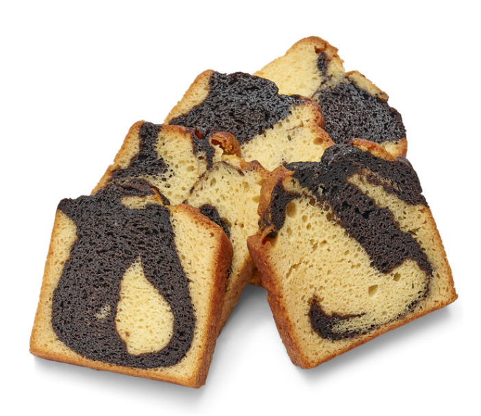
Consumer Unit Net: 4 oz / 114 g

day is used for general nutrition advice.