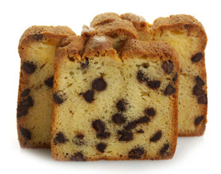
Consumer Unit Net: 4.5 oz / 128 g

Ingredients: Sugar, Enriched Flour (wheat flour, niacin, iron, thiamin mononitrate, riboflavin, folic acid), Chocolate Chips (sugar, unsweetened chocolate, cocoa butter, milkfat, natural vanilla extract), Water, Egg, Butter, Canola Oil, Contains 2% or less of: Annato, Baking Powder (sodium acid pyrophosphate, baking soda), Baking Soda, Corn Starch, Guar Gum, Modified Cornstarch, Mono and Diglycerides, Natural Flavor, Nonfat Milk, Polysorbate 60, Salt, Soy Flour, Soy Lecithin, Soybean Oil, Turmeric, Vital Wheat Gluten, Whey, Xanthan Gum Allergy Information: Contains: Egg, Milk, Wheat, Soy. Made on equipment shared with Tree Nuts.